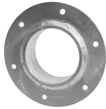
SLF R sleeve

For detailed information, please visit roxtec.com .